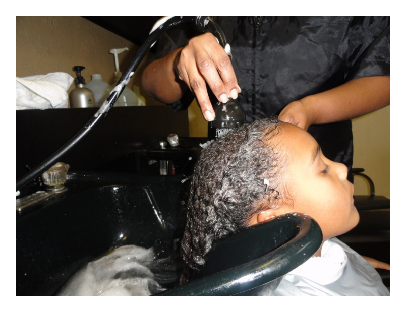
Step 5: Repeat Step 3, using Influance Shampoo formulated for child's hair type.