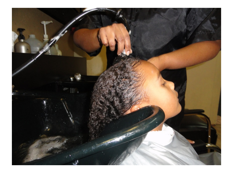
Step 6: Rinse hair thoroughly until all traces of shampoo is gone.