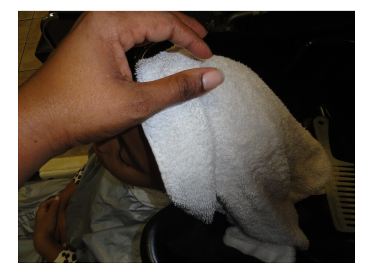
Step 7: Gently towel dry hair.