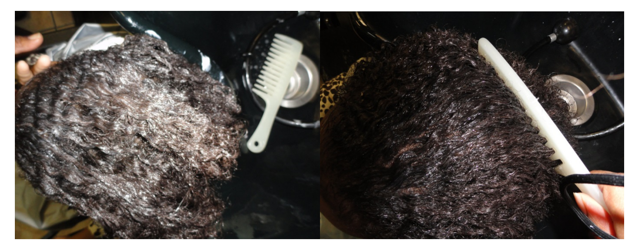
For Deep Conditioner: Apply a plastic cap and place your child under a hooded dryer for 10-15 minutes.

Step 8: Apply generous amount of Influance Conditioner designed for child's hair type. Distribute evenly throughout hair. Comb the conditioner from the scalp to the hair ends. Allow this to sit on the hair for 5-7 minutes.